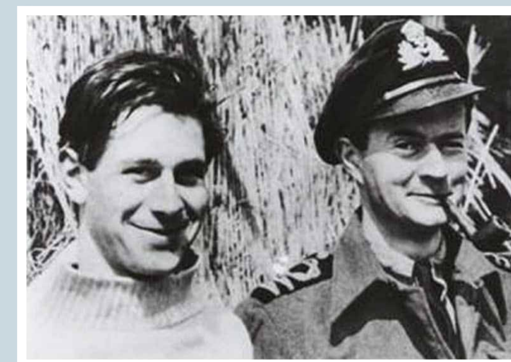
Lieutenant Godfrey Place (HMS X-7) & Lieutenant Donald Cameron (HMS X-6) - Attack on the Tirpitz - September 1943